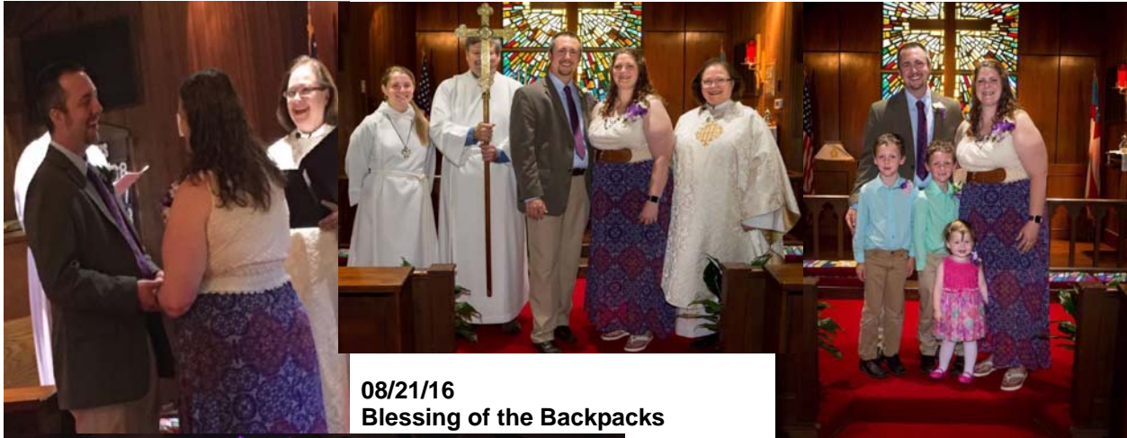
08/21/16 Blessing of the Backpacks